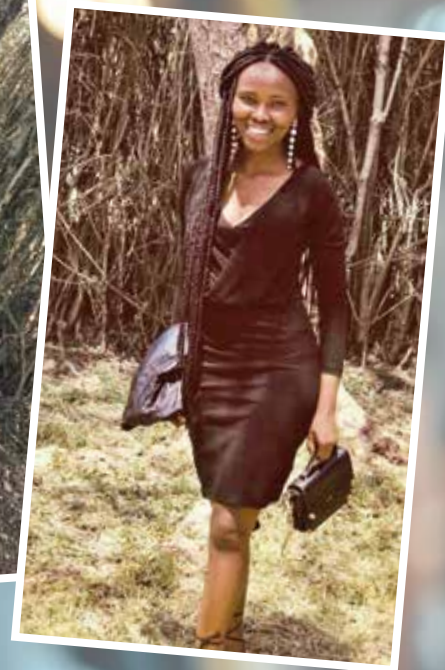
Fashionista Florence models some of her latest creations.

very few girls from Mt. Elgon would ever have the chance to experience. Upon graduation, they take part in a year-long program before entering college, skills training or entrepreneurial training according to their natural abilities and desires.